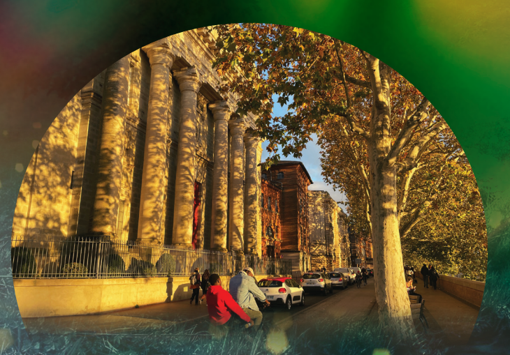
Banks of the Garonne River