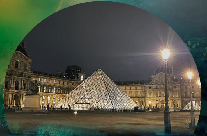
Louvre Palace at night